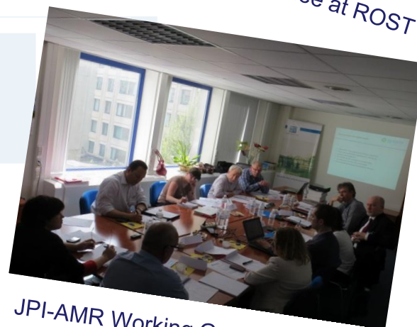
JPI-AMR Working Group at ROST