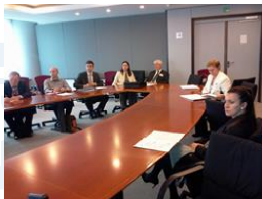
ROST at the European Parliament