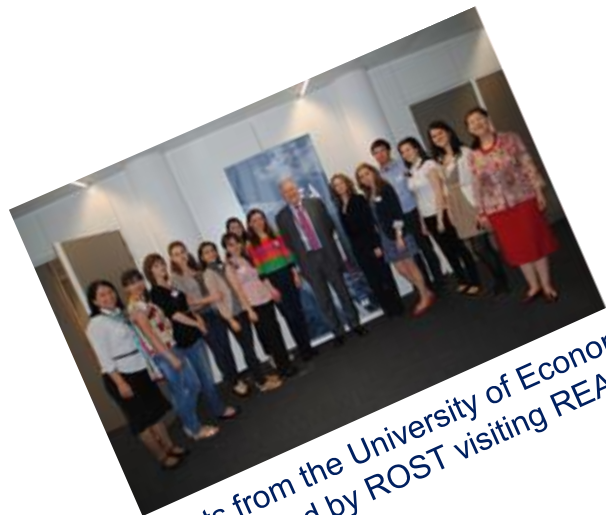
Students from the University of Economic Studies hosted by ROST visiting REA