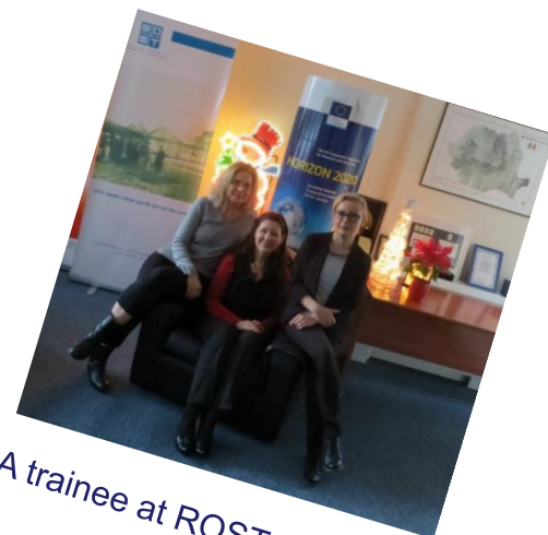
A trainee at ROST